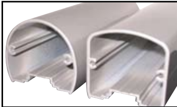
Welded Picket Top Rail Round and Square